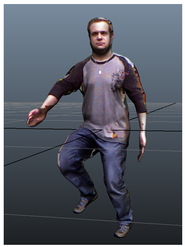
(c) Rigged, Textured, and Animated Avatar

Figure 1: (a) Avatars are generated by aggregating a point cloud from a consumer depth sensor. (b) The resulting cloud is reconstructed to form a watertight 3D mesh. (c) The final rigged, skinned, and textured mesh can be fully animated in real time.